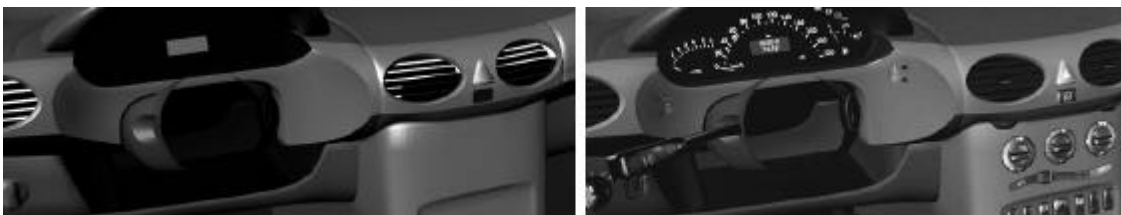
Figure 16.1 Views of the virtual cockpits used in the low (left) and high (right) pictorial realism settings. The cockpit on the right featured colored surface textures. The virtual steering wheel was replaced by a real one in both settings.

We thus decided to employ the multidimensional concept proposed by Schubert et al. [1]. These authors suggested to differentiate between (a) 'spatial presence' (highly correlated to the 'classic' sense of being there), (b) 'involvement', and (c) 'realness'. The authors claim these to be three different facets of a more general presence construct [1, 10, 14]. They base their claim on the results of factor analyses of a large data set collected in an online survey. The three presence facets correspond to factors extracted in their analyses. Their findings are generally supported by work of Lessiter et al. [11], who found similar presence facets in an extensive cross—media study.